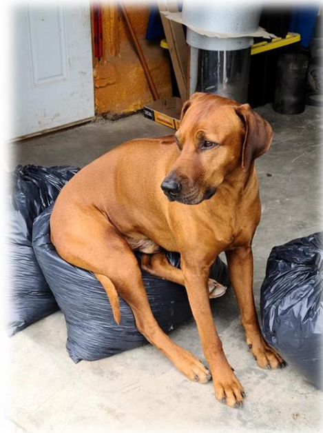
guess there was no Lab available