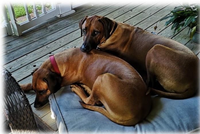
Delly and Tau