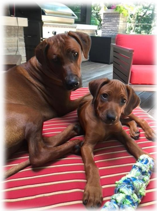
Hazel and Tucker