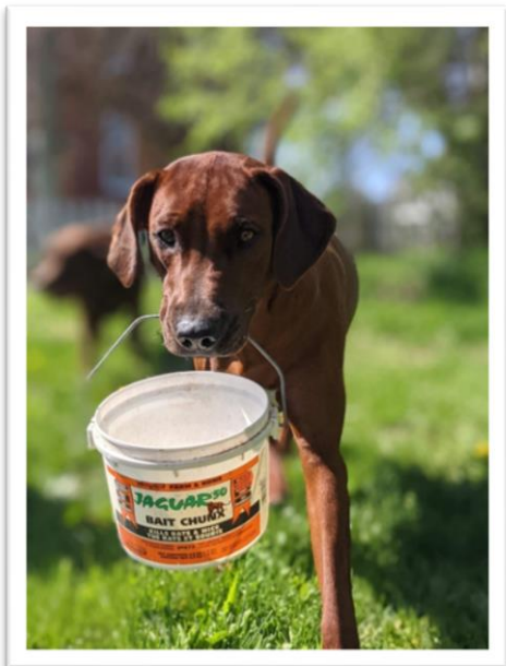
Anoona helping feed the chickens

There are working Ridgebacks..... and then there are my Ridgebacks