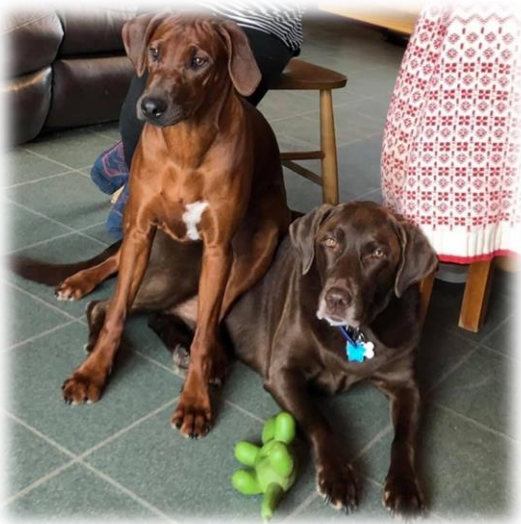
Funny Anoona Lab sitting