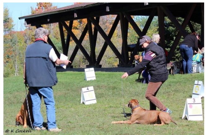
Obedience Practice at the October 2016 Club Picnic