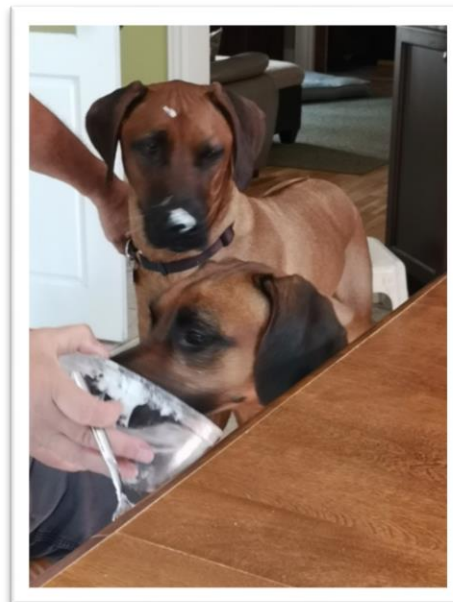
and mine working the table