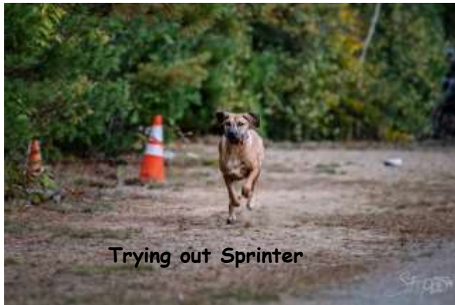
Trying out Sprinter