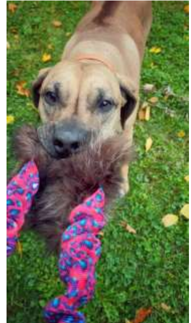
Learning to play with my human