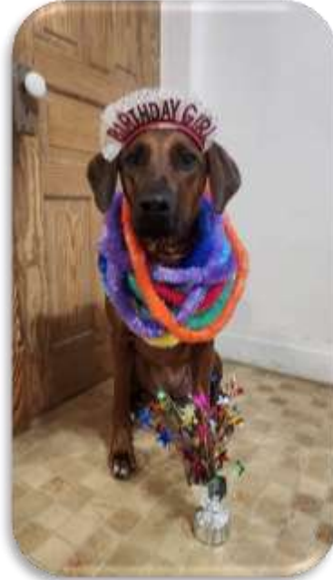
Happy Second Birthday Freya