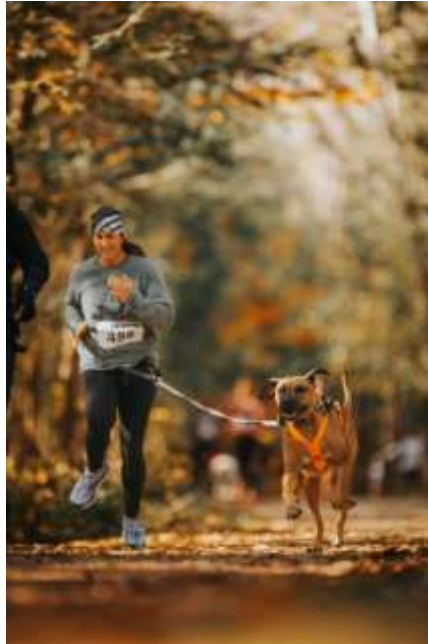
First Canicross Race