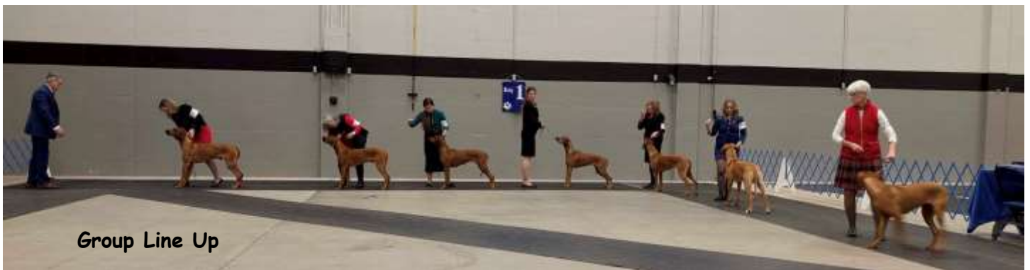
Group Line Up