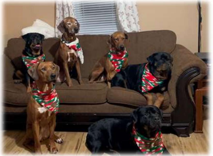
The Gang's all here