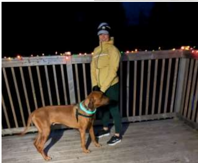
Spud ready for 10k run