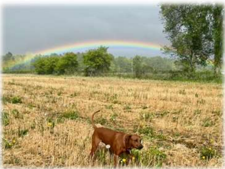
Ruby Somewhere under the Rainbow