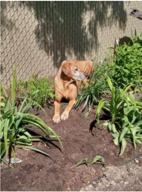
in the garden