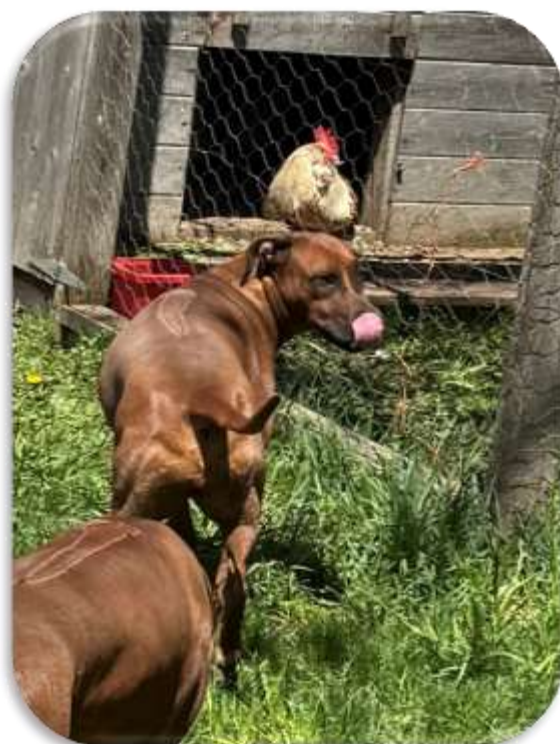
Anyone else like chicken? Just asking for a friend