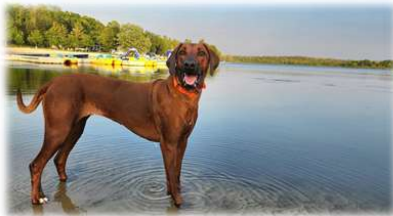
Freya Water Dog