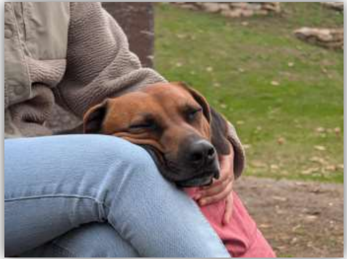
Mom's knee makes the best pillow