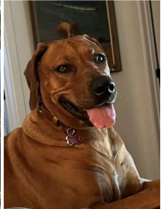
after a long walk