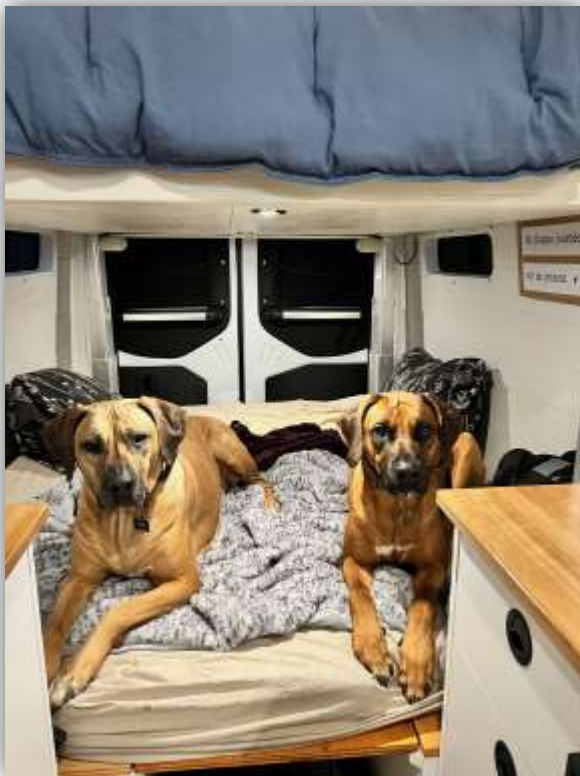
Dexter & James go camping