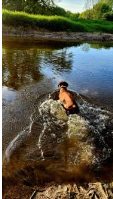
in the lake